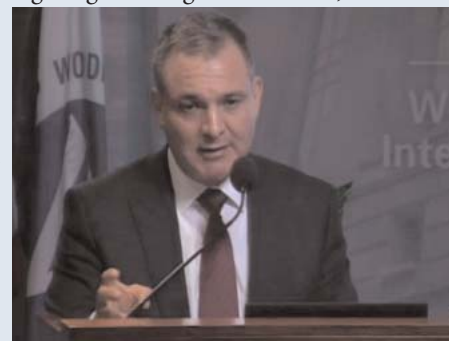
García Luna spoke Wednesday at the Wilson Center in Washington.

"The foundation of a safe country is in the early detection of crime. When society is inhibited, or intimidated, they stop participating and this severs the process," he said.